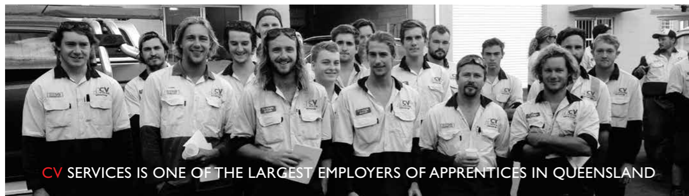
CV SERVICES IS ONE OF THE LARGEST EMPLOYERS OF APPRENTICES IN QUEENSLAND